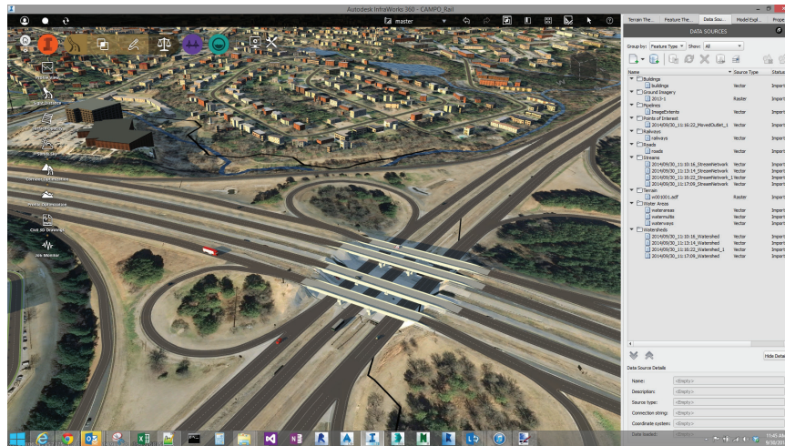
A BIM process lets you explore projects in the context of existing conditions more easily.

Data in many of the most common spatial data formats can be incorporated into your model with no need for conversion. The objects within the model have attributes that make them more intelligent. For instance, a pipe looks like a pipe in your 3D model. The pipe will also have a diameter, depth below ground, and a relationship with other objects within the model. This is unlike what you may be used to in traditional CAD-based preliminary design, where you see elements like utilities as a 2D layer that lacks a defined relationship to items depicted in other layers.